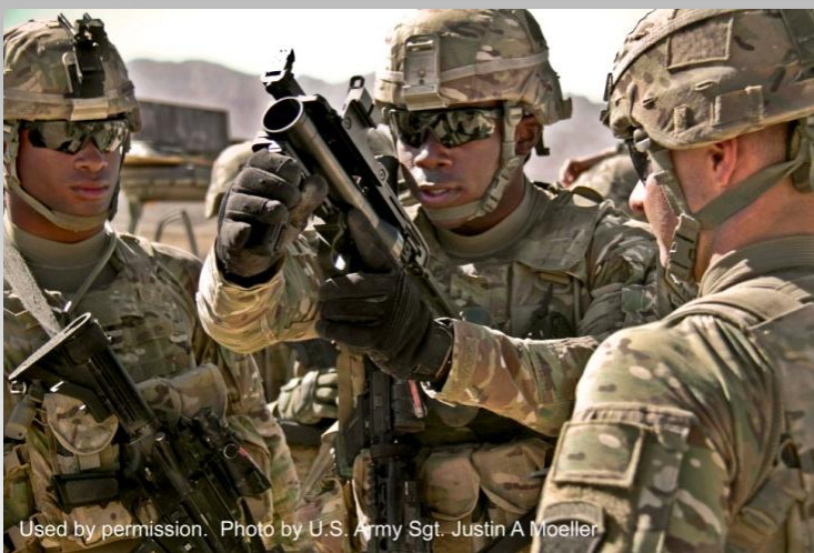
Used by permission.

AMTEC continues to exceed requirements for quality and reliability for 40mm Grenade Production